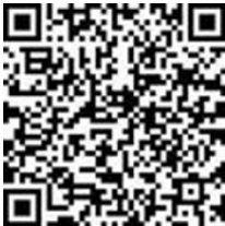
(Creating and Editing Gifts)