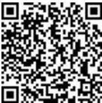
(Managing My Giving)

The Necrology Book (or the Book of the Deceased) will be placed in the Church. Please feel free to add the names of your loved ones who have died. The book will be left out for the entire month of October. We will pray for those who have died at the All Souls Prayer Service on Sunday, November 2nd at 7pm. The Necrology Book will remain in the Sanctuary during the month of November.