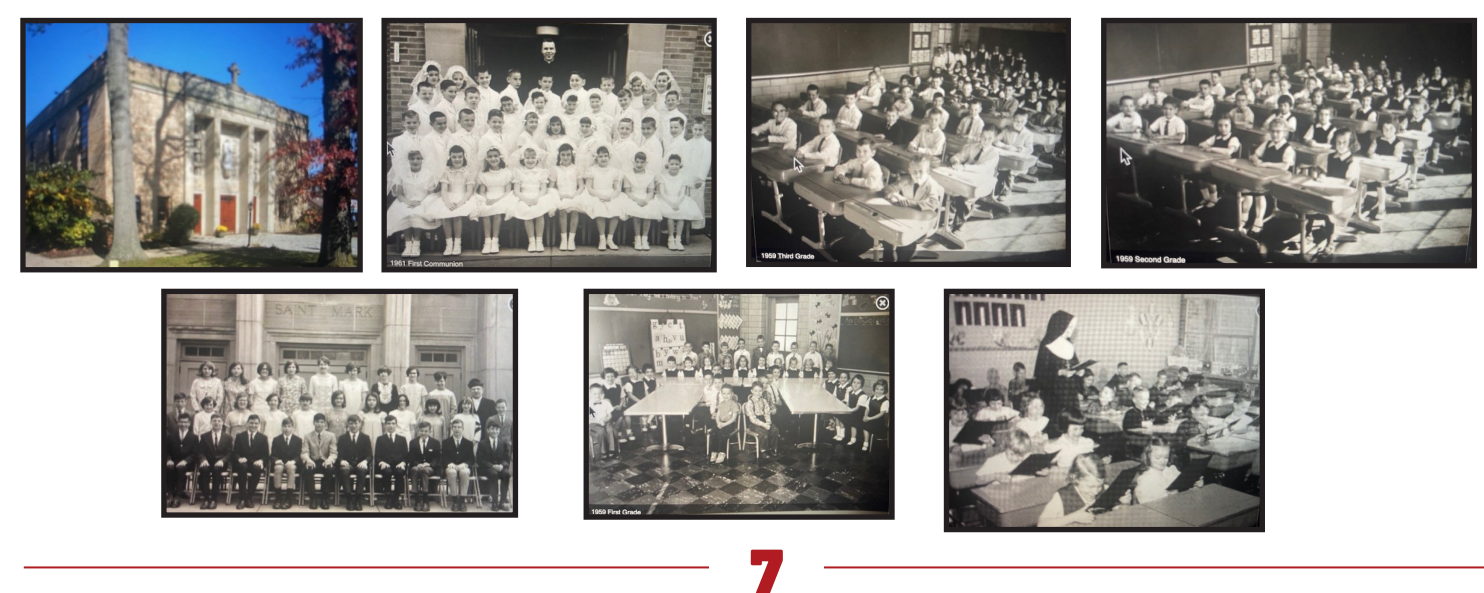
TWENTY-NINTH SUNDAY IN ORDINARY TIME